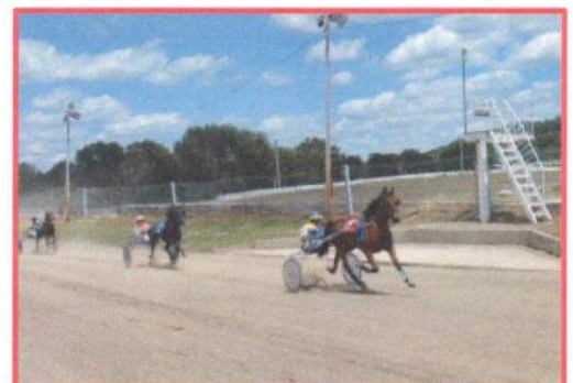
2008 Afton Fair Harness Racing

The Afton Fair would also welcome any type of farm animal for display the during the fair. Care can be provided if desired. Some animals are required to meet specific health requirements in order to be brought onto the fairgrounds. If you are interested, please contact Lia Tingley at 343-5913 for more information and to ensure your animals meet the health requirments. Transportation of the animals is available if needed.